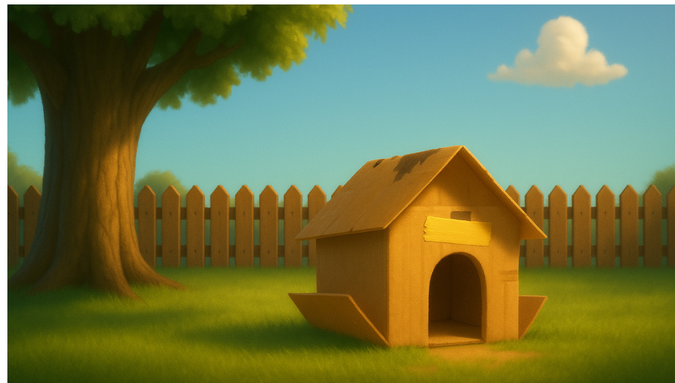
WHAT THE BUDGET ALLOWED