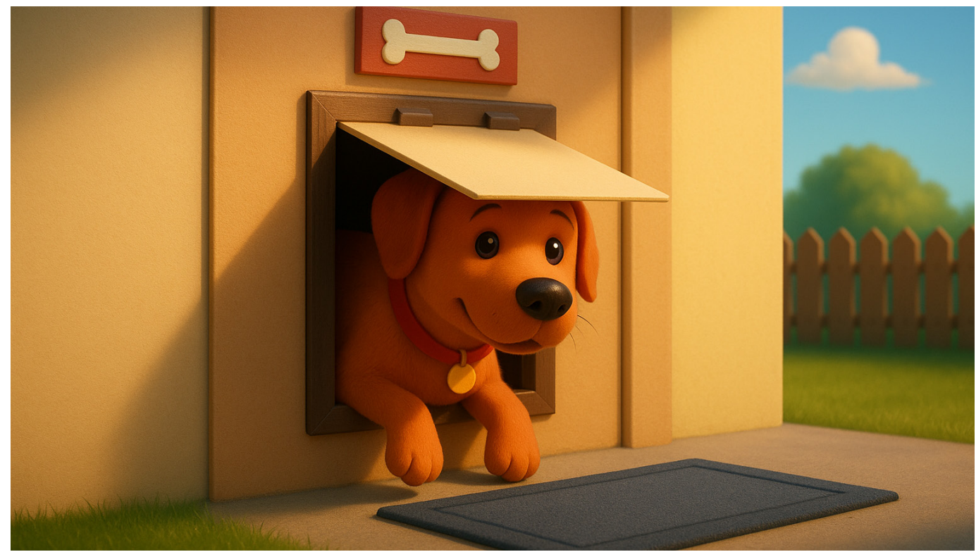
WHAT THE CLIENT REALLY NEEDED

Contractors are then asked to price the project in a compressed timeframe. Gaps or ambiguous details in the drawings often go unnoticed or unresolved.