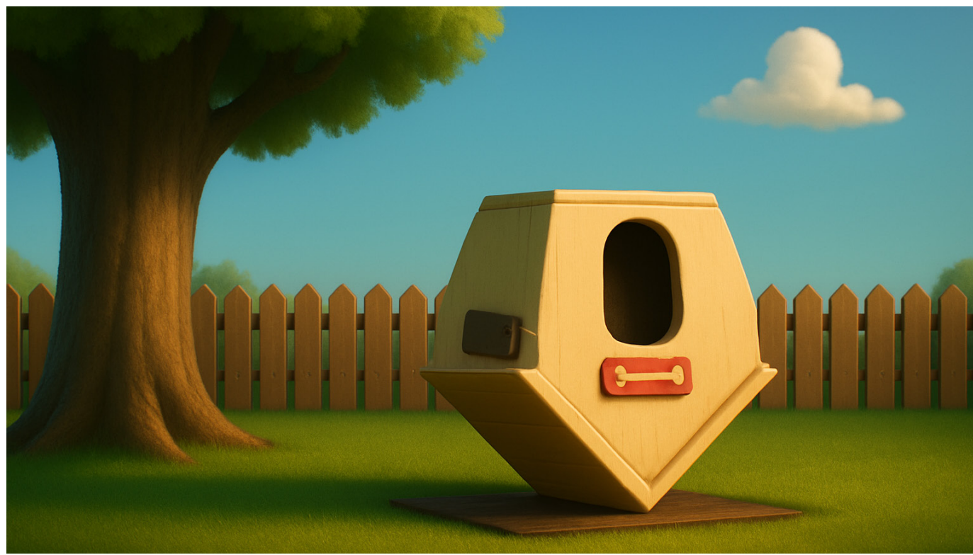
WHAT THE CONTRACTOR BUILT