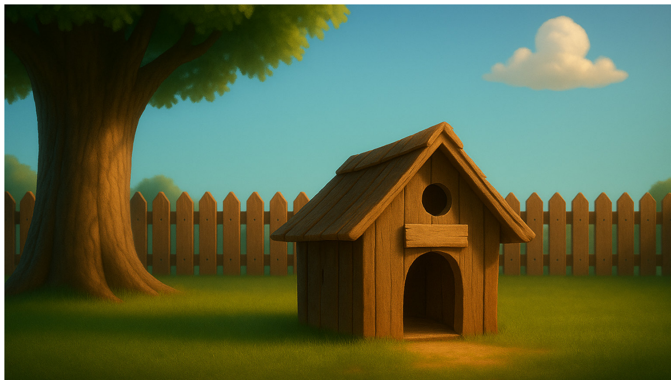
WHAT WAS ESTIMATED