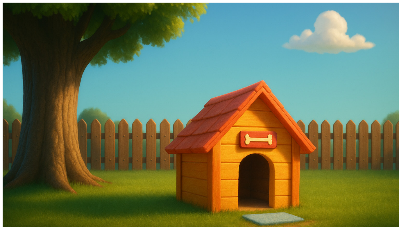
WHAT THE CLIENT DESCRIBED