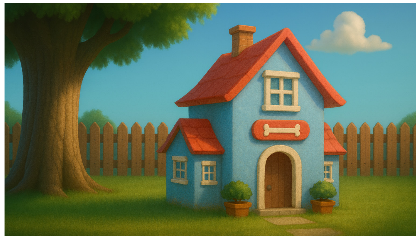
WHAT THE ARCHITECT DESIGNED

Designs that miss the mark. Schedules that slip. Budgets that won't hold. Communication that starts to break down.